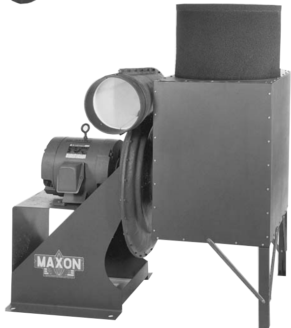
Blower with Silencer and Washable Filter