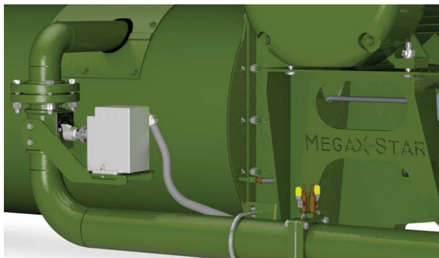
Direct coupled fuel motors eliminate the need for linkage connections.

Available in sizes ranging from a nominal 50 to 150 million Btu/hr (14,650 to 43,960 kW), the MegaStar is ready to meet your production needs. The standard design can be applied to applications up to 1500°F (815°C). Custom lengths are also available for warm-mix applications.