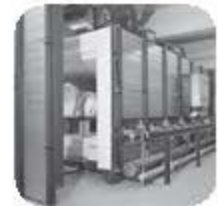
Intermittent shuttle kiln