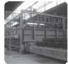
Bogie hearth furnace

At least once a year, twice a year in the case of biologically produced methane.